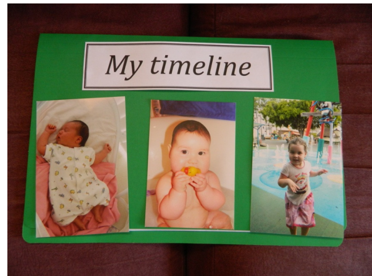
A completed cover

Assemble cover first. Cut out one copy of the heading and attach it to the top of your manilla folder (landscape orientation, the top edge will be at the fold). Attach the photos under the heading.