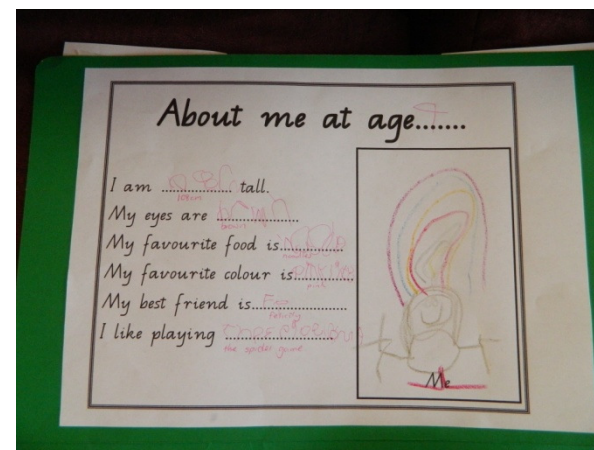
A completed about me page by my 4 year old

Open the manilla folder. The top half will have the “About me at age...” sheet. The child fills answers the questions and draws a self portrait in the box. Attach this sheet once it is completed.